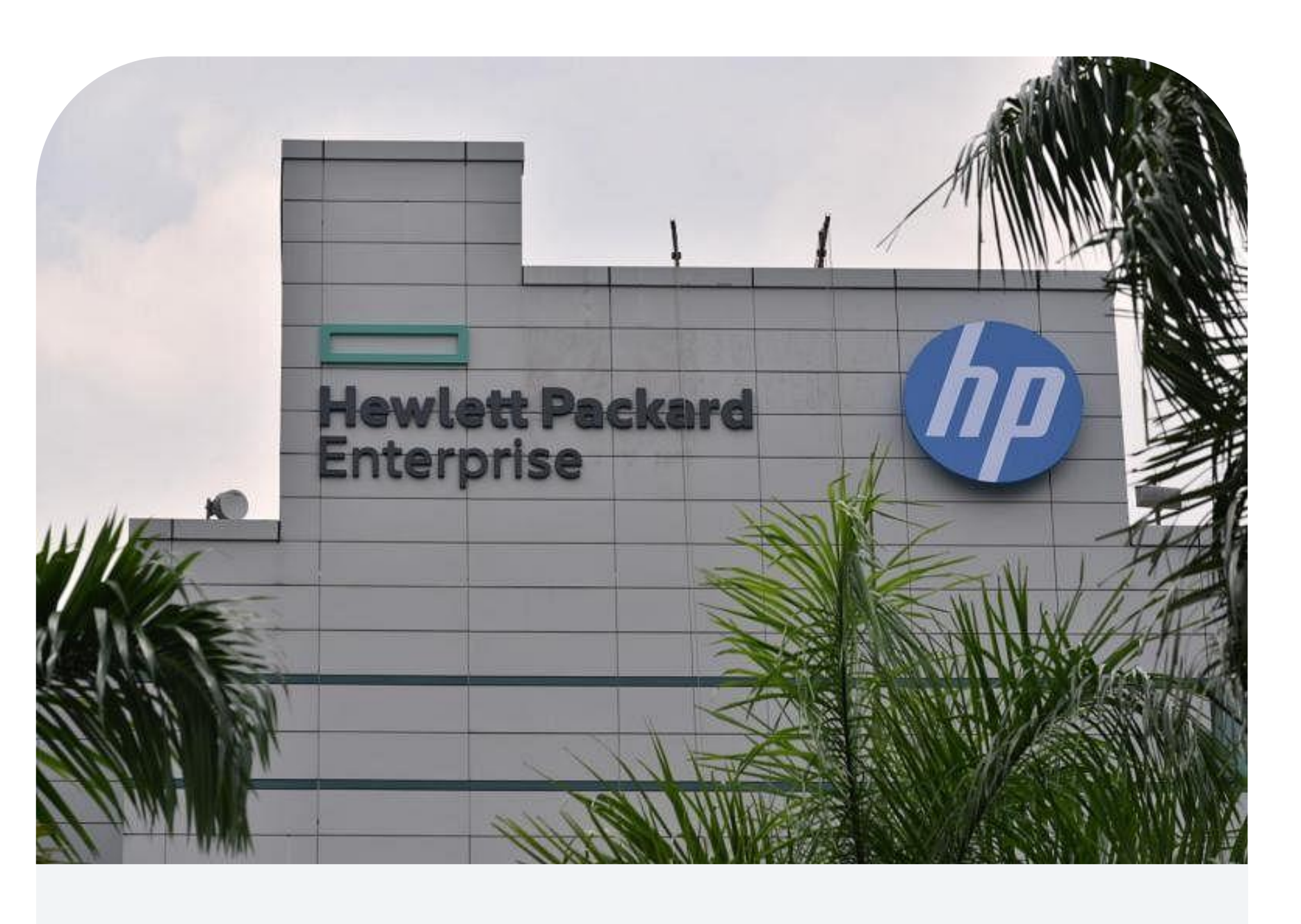
Hewlett-Packard 30.3% improvement in chiller plant, or 1.2 GWh of annual energy savings.