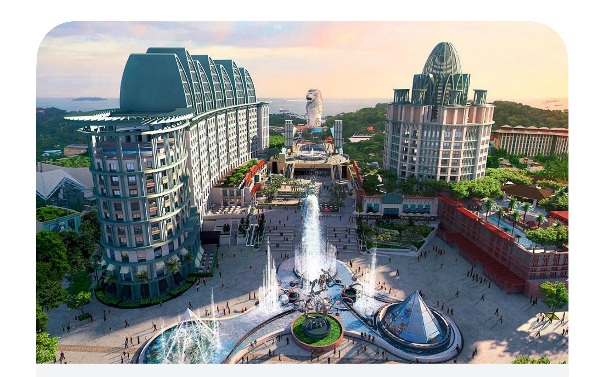
Resorts World Sentosa District Cooling Plant 11.2% improvement in chiller plant efficiency, or 5.5 GWh of annual energy savings.

industrial • semiconductor • hotels • shopping malls • data centres • offices