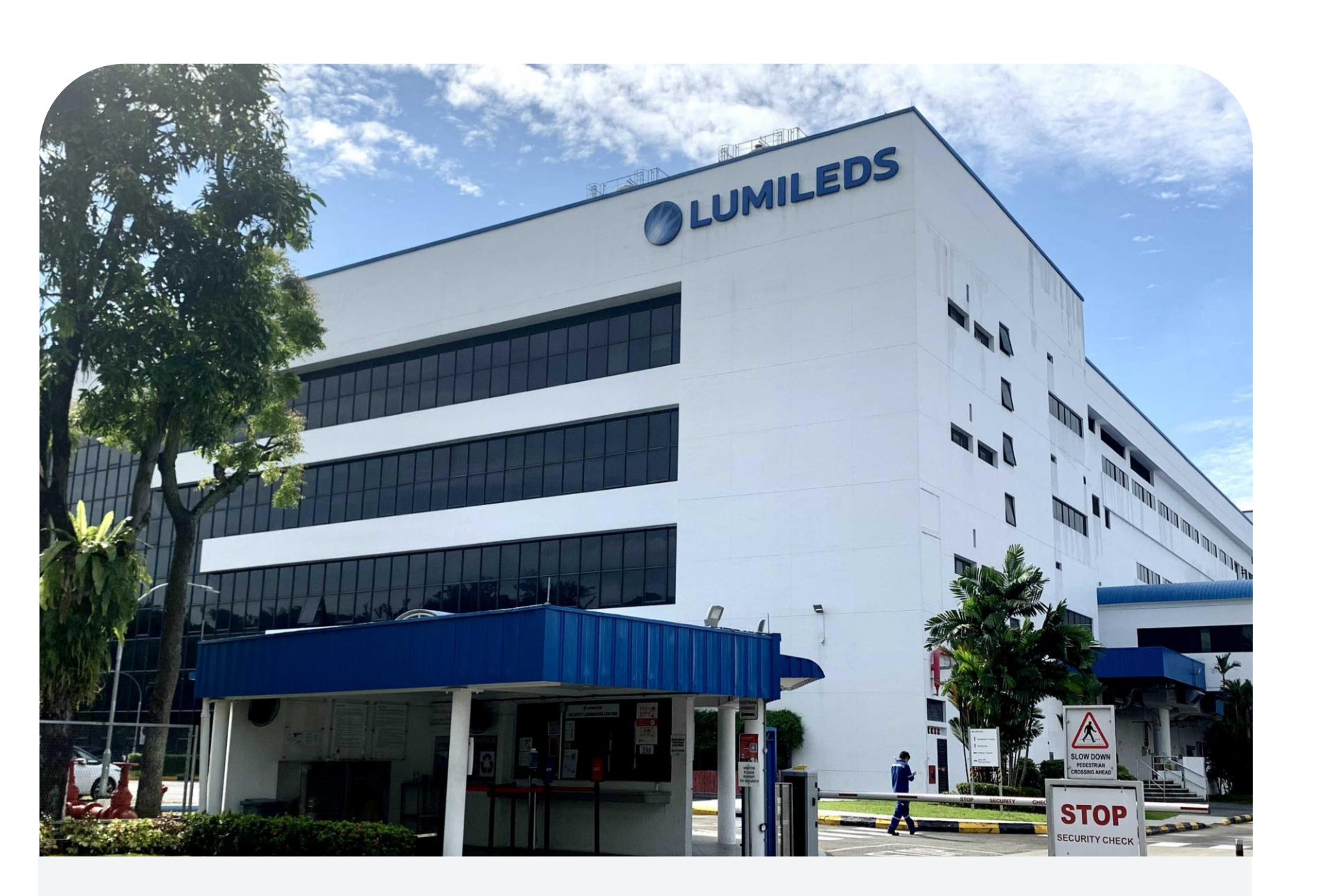
Lumileds 27.6% improvement in chiller plant efficiency, or 2.9GWh of annual energy savings.